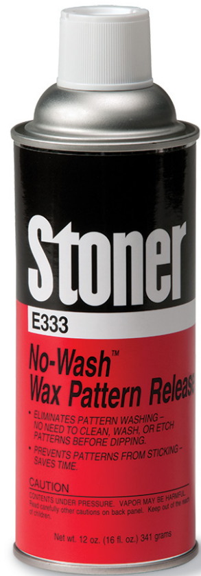
Item # E333

A major Investment Casting molder of sophisticated parts made the switch away from silicone wax pattern release. In this case they needed to move away from their solvent based pattern wash and the resulting issues associated with it.