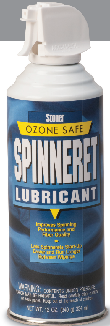
Item # S261

Melted Fibre Opportunity: Manufacturers of recycled plastic fibre, seatbelt fibre, tire cord, air bag fibre, and textile fibre.