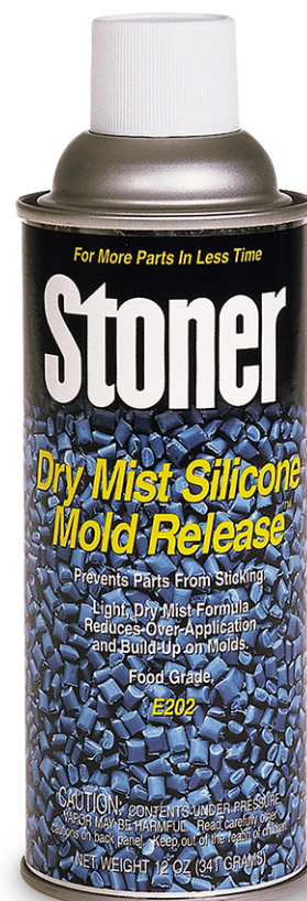
Item # E202

Investment casting molders worldwide find Stoner's unique ability to formulate and manufacture helps them save time and money. A consistent and reliable spray pattern ensures part-to-part integrity - more high quality patterns in less time.