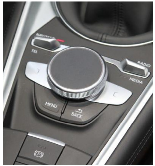
Stoner E302 allows part to be post processed with no further cleaning.